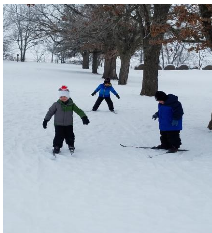
Cross Country Skiing