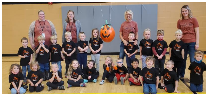
Preschool's CUTE little pumpkins!