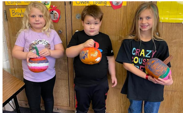
3 way tie for 2 nd Place