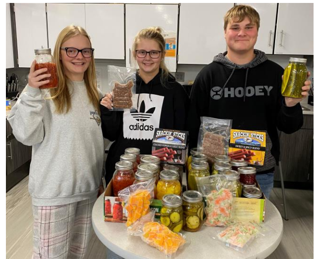
Some of the food we have processed!

If you have meat or vegetables or fruit that you'd like to donate to the class at any time, please contact Ms. Christianse by email at jchristiansen@midland.k12.ia.us or by calling 319-259-5340 ext 2080.