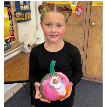
3 rd Place