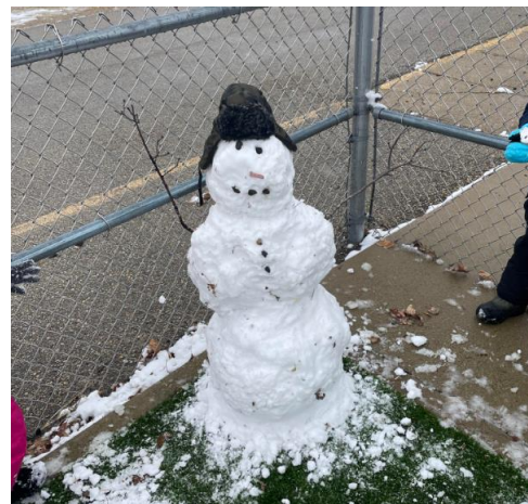
1 st Snowman of the season!

Wrap Care students had too much fun building their first snowman in November!