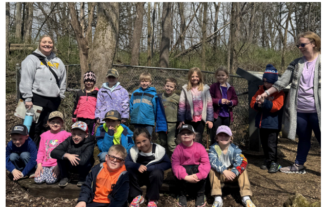
Kindergarten went on a field trip to the EB Lyons nature center in Dubuque. We learned all about the native animals found in Iowa and went on a hike exploring different plants.