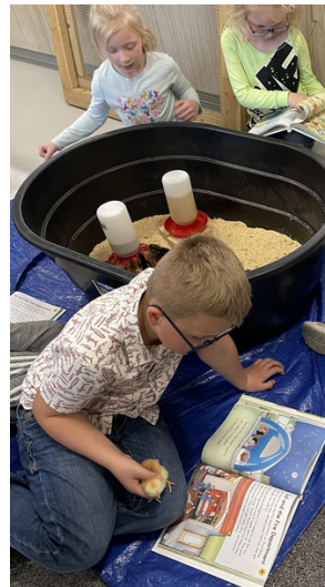
The chicks have hatched!! 1st Grade students put eggs into incubators and then waited patiently for 21 days. Students were able to watch as each chick was piping a hole and zipping out of the eggshell. Now the baby chicks can be heard peeping in the classrooms as students read to them, hold them, and do chicken chores daily. Mrs. Gnade applied for an Iowa Ag Literacy Foundation Grant to purchase a new incubator, eggs, and supplies for the growing chicks.