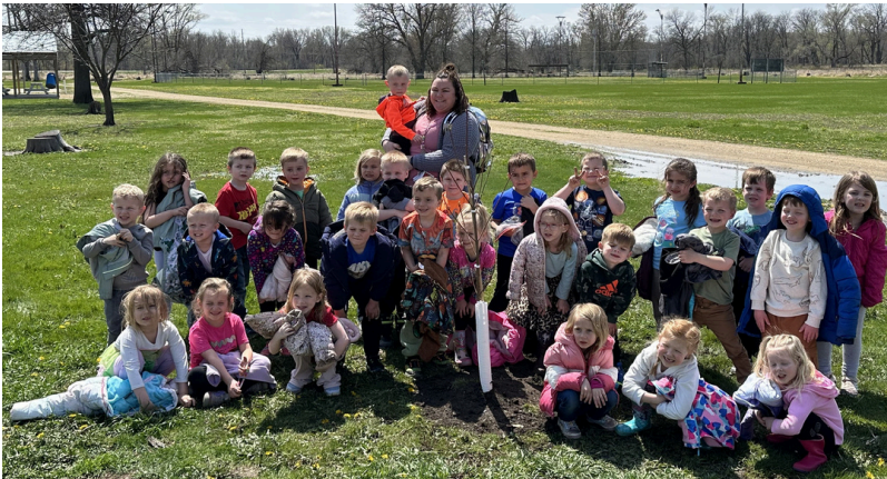
Preschool planted a tree at the OJ Legion for Earth Day! We toured the Thomsen Filling Station for our Career Unit and finished with an ice cream treat!